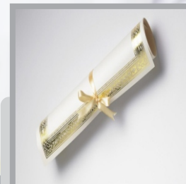
Iron Man of India Award 2021