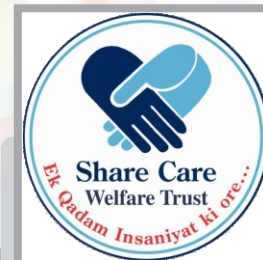
Share Care Welfare Trust Member