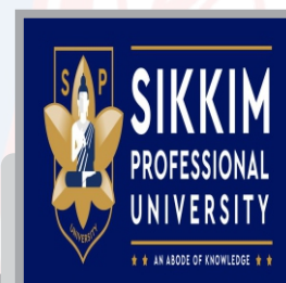
Sikkim Professional University Sikkim Education Partner 2022