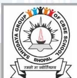
Shahodaya Educational Group