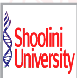
Shoolini University Himachal Pradesh 2022 Member