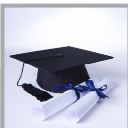
Shoolini University Himachal Pradesh 2022 Member