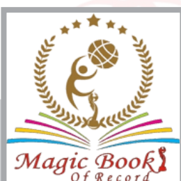
Magic Book of Record Organization Member Delhi 2021