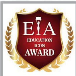
Education Icon Award 2021 Best Paramedical Council of India