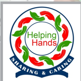
Helping Hand Trust Member