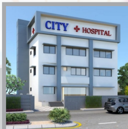
City Hospital Corona Warrior Certificate